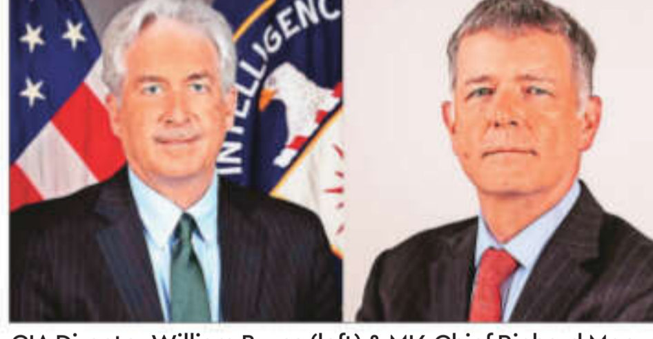
CIA Director William Burns (left) & MI6 Chief Richard Moore

Speaking alongside Moore at a rare public event in London, CIA Director William Burns said the offensive was a "significant